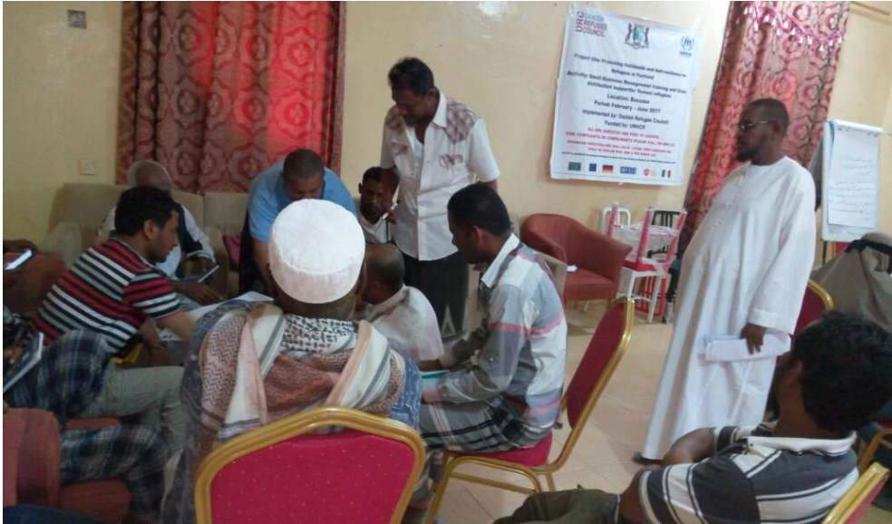
Yemeni refugees at the training on entrepreneurship. © UNHCR / June, 2017