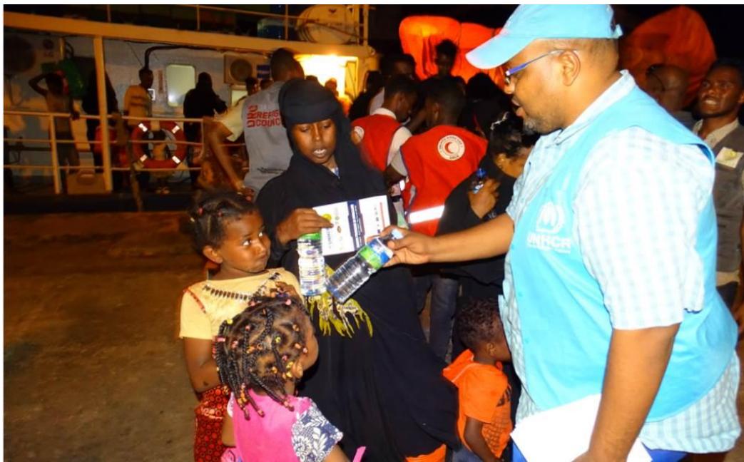
UNHCR staff provides water and information on assistance in Somalia to Yemeni refugees and Somali returnees from Yemen at the port in Berbera. © UNHCR / July, 2017