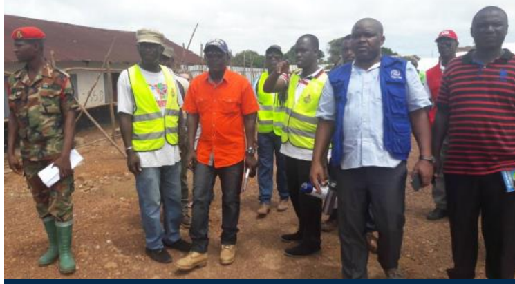
IOM Officer in Charge participates in Government Delegation assessment visit of Juba Barrack site IOM 2017