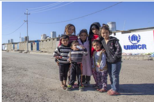
Gawilan camp, Duhok

Sexual and Gender-based Violence (SGBV) The Taskforce about Gender-Based Violence Information Management System organized a six days workshop with SGBV case management partners with the purpose of reviewing the existing data about SGBV incidents and case management work undertaken in Iraq. The participants also agreed on the protocols to share information respecting the confidentiality guidelines.