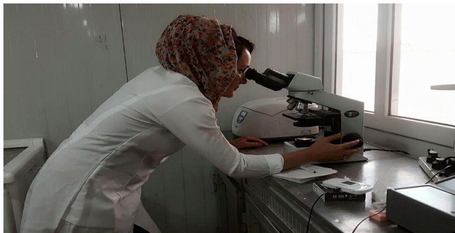
DoH Lab technician in Qushtapa camp PHC