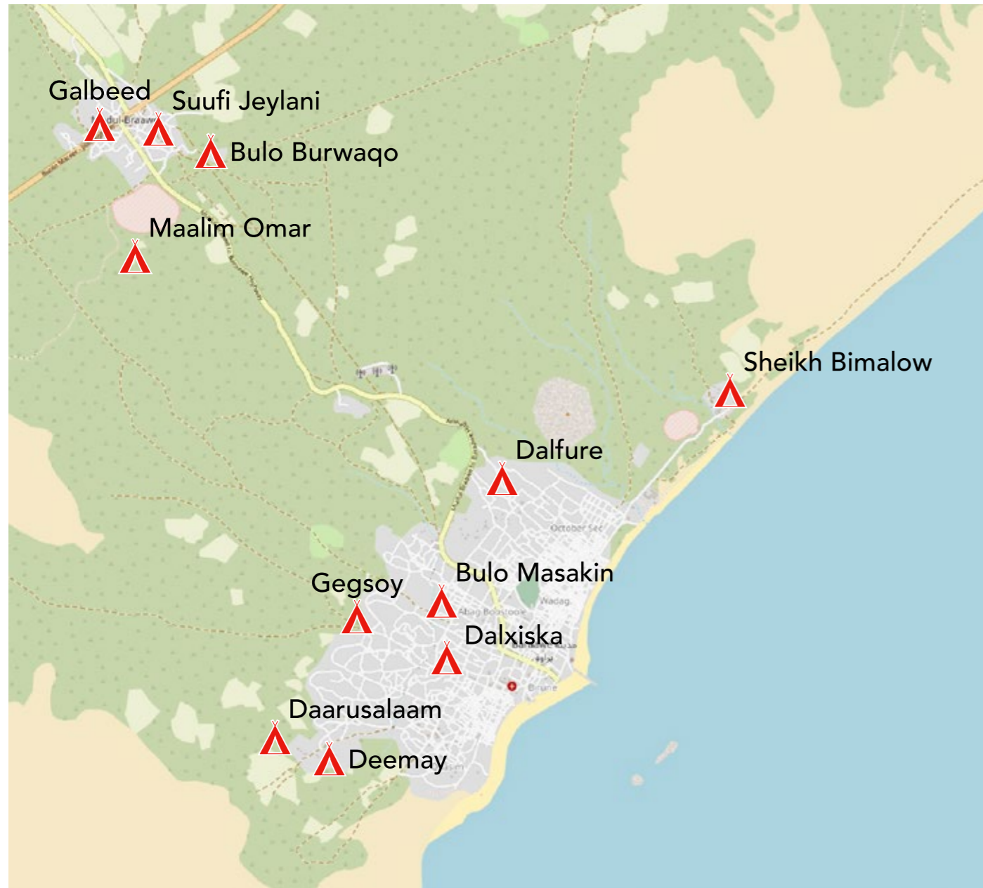
Map of verified IDP sites in Baraawe - May 2023

Download dataset - https://bit.ly/42UtQtK