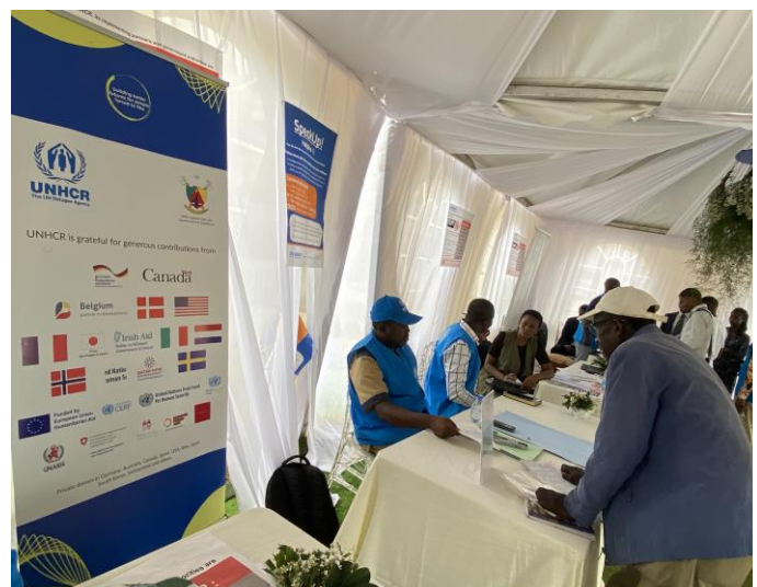
The community of IDPs, urban refugees, Yaoundé residents, and stakeholders attended UNHCR Open-Day, during which they gathered information and discussed challenges, pressing needs, and solutions for forcibly displaced with UNHCR teams.

03 Field Unit: Batouri, Touboro and Douala