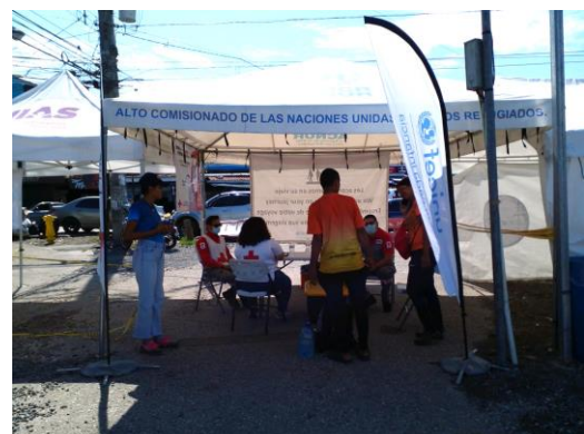
UNHCR information post, Red Cross partner provides humanitarian assistance to people in transit/Norberto Giron/ 2023

Most of the people in these mixed movements show high levels of fatigue, many of them have skin lacerations and allergies, as well as gastrointestinal problems. The presence of homeless family groups during their transit through Costa Rica is inconsistent. Likewise, due to the deteriorated state of health, it is common to identify children in need of attention. The majority of people travel by public transport in family groups, with few resources and few health protection measures.