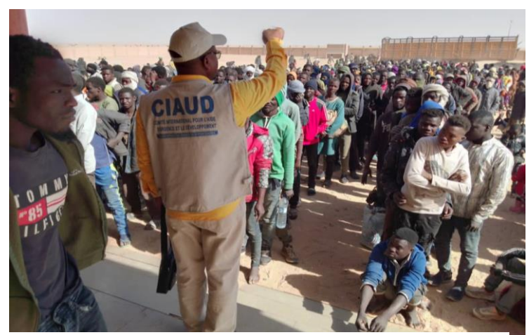
Awareness session for migrants and refugees returned from Algeria to Niger in Assamaka

The situation of mixed movements in Agadez is of growing concern to humanitarian actors due to recent waves of arrivals of official and unofficial convoys of deportees from Algeria. As of 31 March, 11,426 people have crossed into border villages in the Agadez Region, including 4,942 Nigeriens officially expelled from Algeria, 2,484 Guineans, 1,807 Malians, and many other nationals. The number of arrivals has increased since January: 2,581 people arrived in January, 3,584 in February, and 5,261 in March.