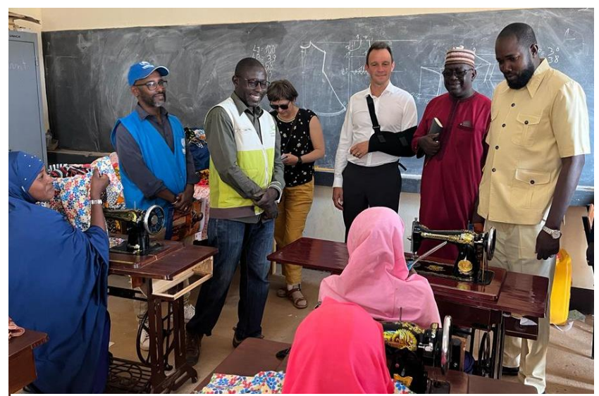
Joint visit by the European Union, the Government of Niger and UNHCR to the Humanitarian Site in Hamdallaye, near Niamey

UNHCR has rallied partners involved in the implementation of protection and assistance activities for urban refugees and asylum-seekers into one physical structure, called the Guichet Unique (One-Stop-Shop). The One-Stop-Shop has the advantage of reducing costs and allows for an integrated approach, as well as a better coordination of services provided by different partners. Refugees and asylum seekers receive support and guidance in the area of documentation, and information regarding medical, psychological, and education and other forms of assistance. The centre also manages a hotline, which refugees can call free of charge to ask questions, to seek advice regarding assistance, or to make a complaint.