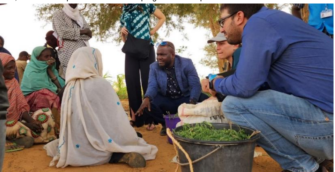
Members of the PRM delegation chat with forcibly displaced women beneficiaries of the Ouallam market gardening project

In February, a U.S. State Department delegation from the Bureau of Population, Refugees, and Migration (PRM) from Dakar and Washington, visited the projects and assessed the impact of UNHCR's interventions for Malian refugees in Ouallam. The mission met with authorities, visited the school, the social housing units, the market gardening site, and spoke with refugees. Having collected preliminary elements during this visit, ILO will carry out an assessment mission to the zone, for the development of a resilience program to be implemented in Ouallam.