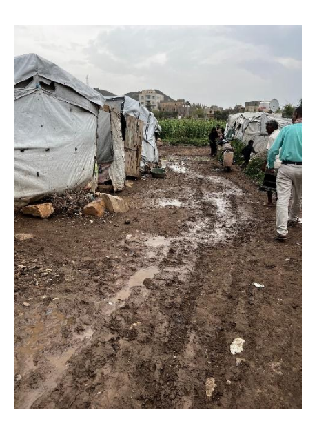
However in the sites managed by DEEM the CCCM team noticed the presence of sign to inform the IDPs on the number to call to refer issues.