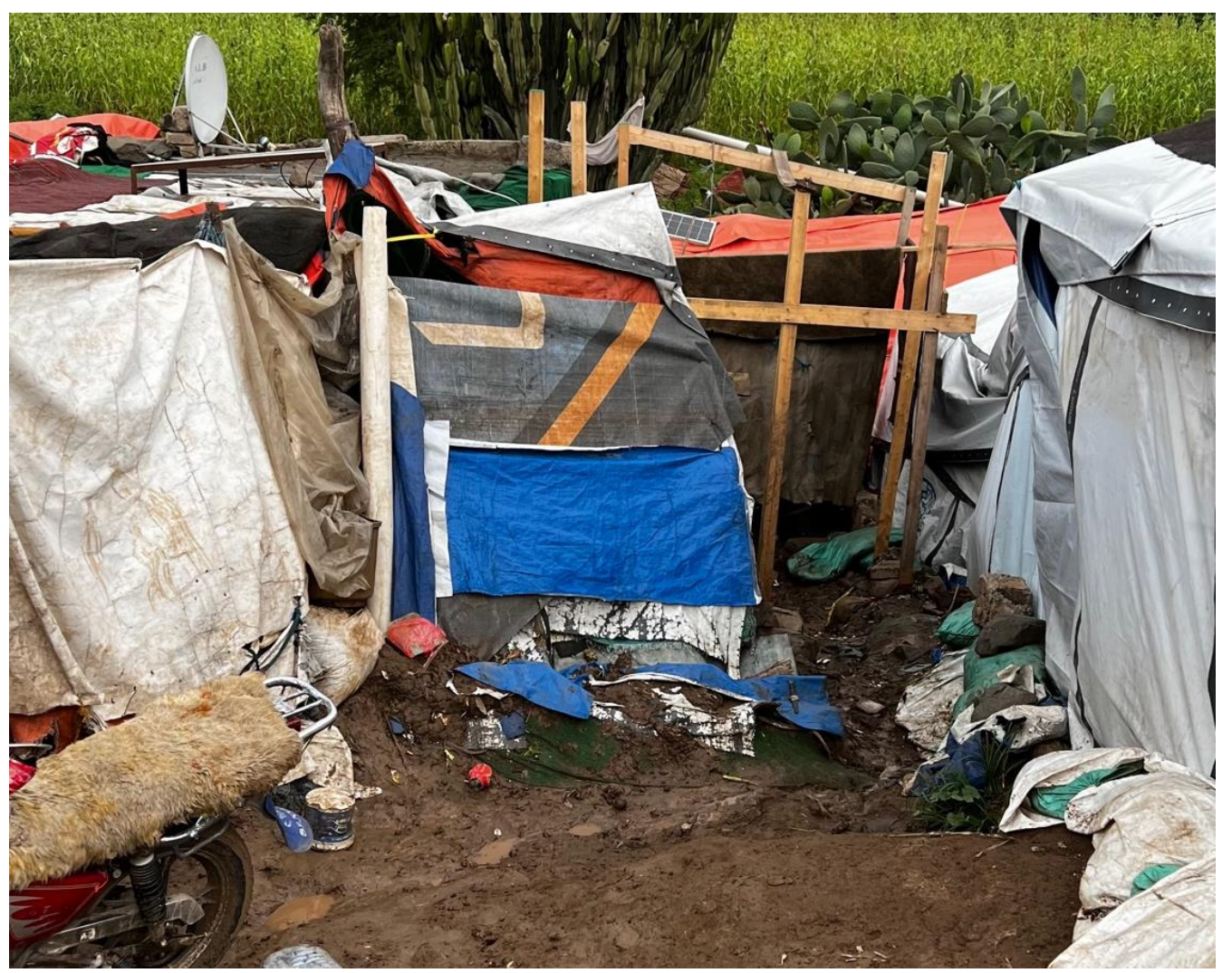
Example in this site for need of site maintenance, and shelter rehabilitation. We can see that the drainage is improvised, the sandbags would have to be replaces, and the water flow will finish to another shelter. However, this part is not most of the situation of the site, and a lot of the shelter have been improved with additional tarpaulin.