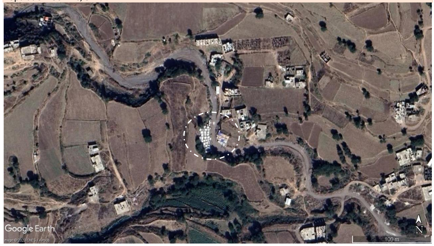
From the Google Earth image, we can notice that this site is separated in by the inner riverbank. This riverbank is also the access road to this site.