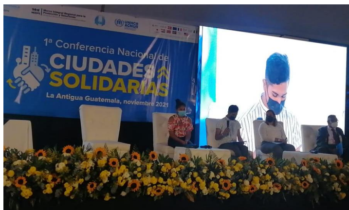
The first Cities of Solidarity Conference organized by the Government of Guatemala, the National Association of Municipalities (ANAM) and UNHCR took place in Antigua Guatemala with the active participation of refugees.