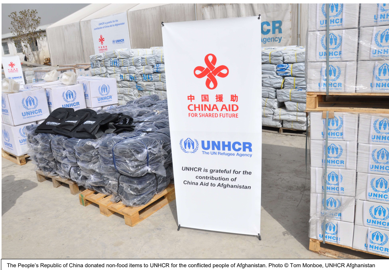
The People's Republic of China donated non-food items to UNHCR for the conflicted people of Afghanistan.

Afghanistan is still experiencing a staggering humanitarian crisis of an unprecedented level and scale. The severity of the situation is further exacerbated by the potential for insecurity, continued political and economic uncertainties, and the COVID-19 pandemic. Over 700,000 conflict-related displacements have been jointly verified since the beginning of 2021 – 80 per cent of them women and children. Overall, 3.4 million people are estimated to be displaced internally countrywide due to conflict while more than 2 million are refugees in neighboring countries. According to the 2022 Humanitarian Response Plan (HRP), some 24.4 million of Afghanistan's estimated 42 million population will need humanitarian and protection assistance this year.