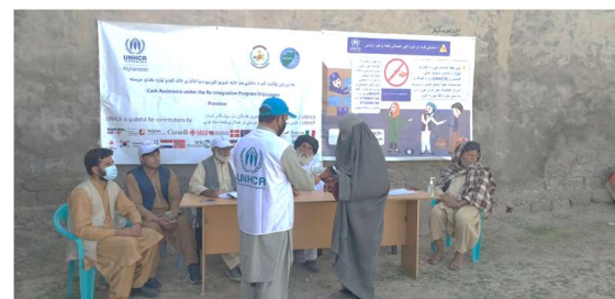
Cash distribution to a female beneficiary as part of some 134 refugee returnee families in support of their reintegration in Urozgan Province, Southern Region in March

***IDP returnees are those who went back to their communities between Jan 2021 and Mar 2022 still under the process of being verified. (Source: UNHCR)