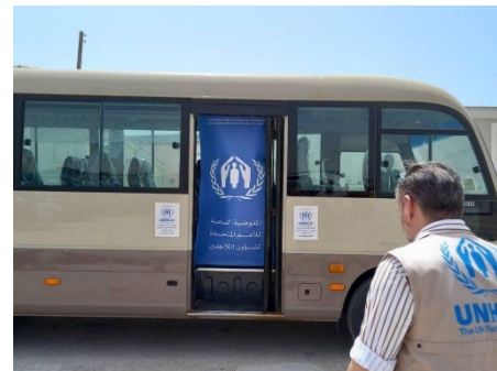
The school bus donated to Al Hileas settlement.

A school bus provided by UNHCR was delivered to Al Hileas settlement, located outside Benghazi, and will provide daily transportation for boys and girls attending secondary school and university. The lack of public transportation connecting the settlement to the city, expensive taxi fares, and the long distances have resulted in many children dropping out of school. This shuttle service will provide safe transportation, and it is hoped that it will encourage many to resume their studies. Some 1,300 displaced Libyans live in Al Hileas settlement.