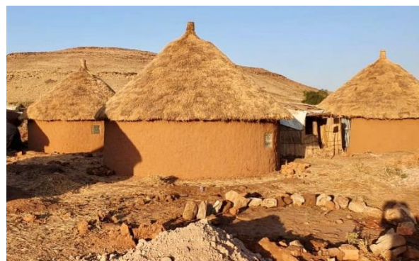
The newly constructed tukuls in Um Rakuba