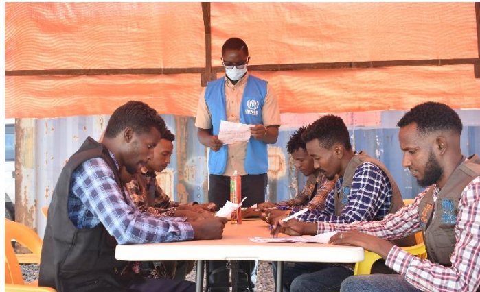
Community volunteers review frequently asked questions on human trafficking and smuggling