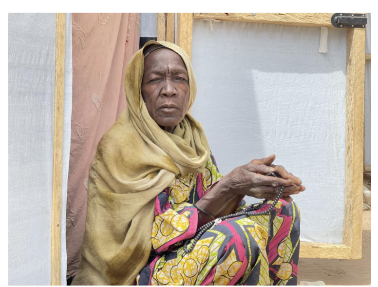
An internally displaced woman near her shelter in Northeast Nigeria.