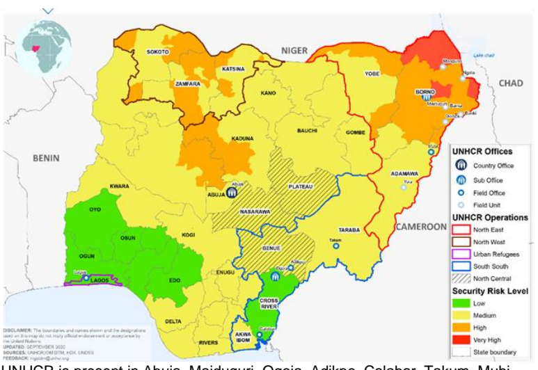
UNHCR is present in Abuja, Maiduguri, Ogoja, Adikpo, Calabar, Takum, Mubi, Lagos, Banki, Gwoza, Bama, Monguno, Ngala, Markudi and Yola