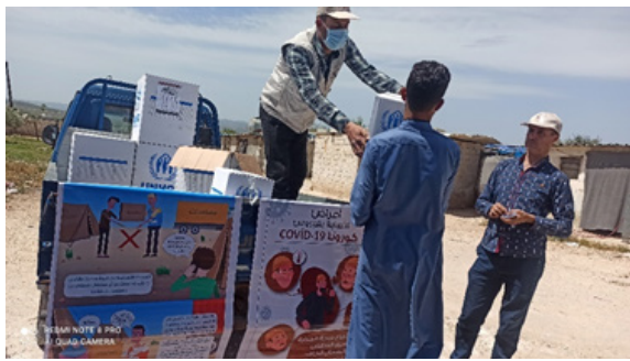
Distribution of hygiene kits for COVID-19 prevention.

UNHCR's protection partners conducted awareness raising and psychosocial support sessions, identified cases and referred them to basic services in Idleb and Aleppo; such community-based protection interventions reached 20,000 people in May. In addition, close to 2,000 displaced and vulnerable people received protection services such as awareness raising on civil status documentation and housing, land and properties, legal consultation and assistance. While spreading awareness on COVID-19 prevention measures, UNHCR's protection partners also distributed 8,908 hygiene kits to some 44,500 people.