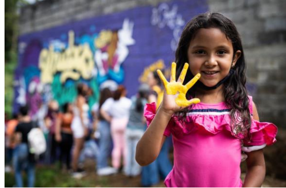
A young girl participates in the painting of a mural with a message of unity in Bello Oriente neighborhood of Medellín.