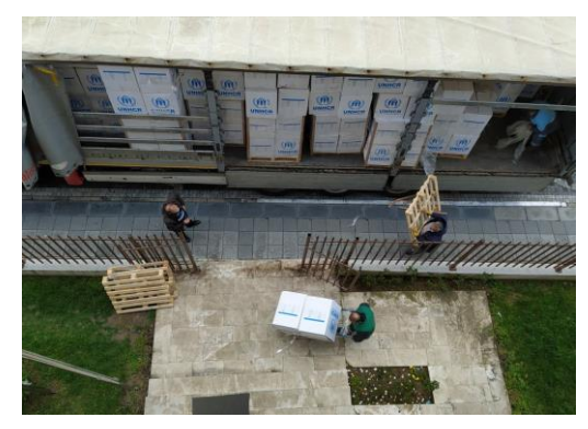
UNHCR distributes hygiene kits in the Marmara region through its partners

Distribution of material needs and hygiene kits to vulnerable populations continues across the country. In the Central Anatolian region, UNHCR continues its distributions through the local authorities, of hygiene items in 28 provinces and core relief items including mattresses and blankets in 30 provinces targeting refugees and host communities. In the Marmara region, UNHCR, through its partners, completed hygiene kit deliveries to 15 municipalities based on requests from municipal leaders. Thus, the total number of hygiene kits delivered to municipalities in the Marmara region between February and March is 42,700 kits.