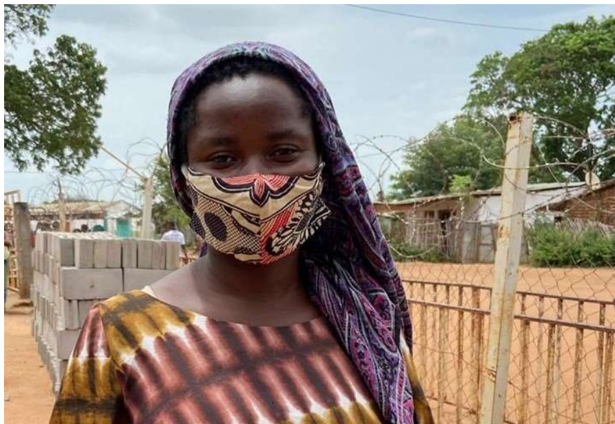
A woman in Maratane refugee camp, Mozambique, wears a mask to protect against the spread of COVID-19. More than 7,000 reusable cloth face masks have been produced and distributed in Maratane during the COVID-19 pandemic.

At the same time, concerning reports of rising xenophobia and stigmatization of refugees continue to be noted in the region. Stigmatization is not only linked to perceptions that refugees carry COVID-19, but also related to increased economic pressures as a result of COVID-19 restrictions. This impacts the physical safety of people of concern as well as damages social cohesion and peaceful coexistence with local communities. UNHCR is making efforts through its social cohesion programming to roll out initiatives that enable dialogue and foster good will and understanding between refugees and their hosts.