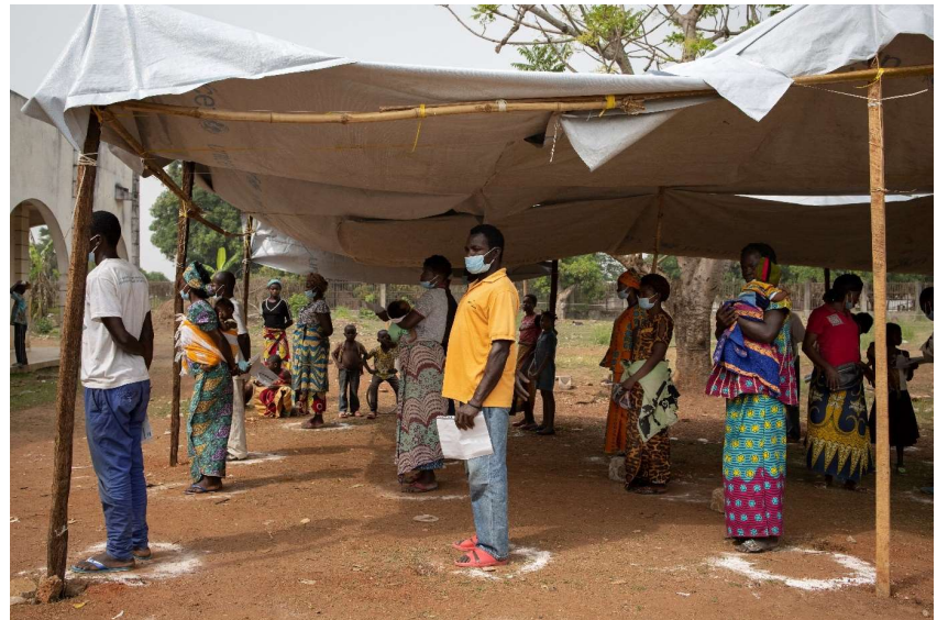
Newly arrived Central African refugees queue at a UNHCR distribution of core relief items in Yakoma, Democratic Republic of the Congo. Measures have been put in place during distributions to prevent the spread of COVID-19.

2.7 million people reached through COVID-19 risk communication