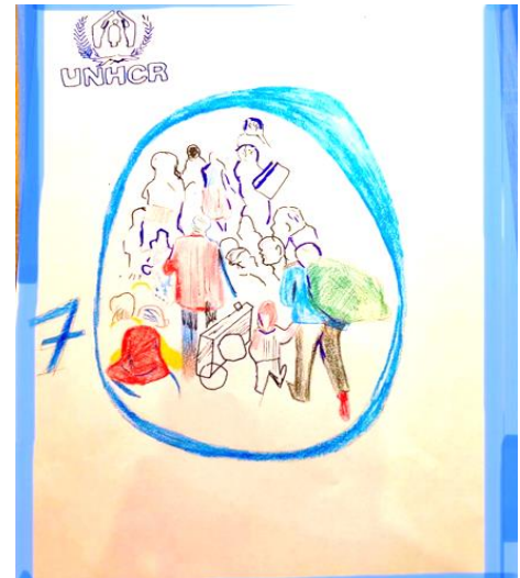
Youth event on occasion of UNHCR 70 th anniversary and a young refugee's piece of art as present to UNHCR

UNHCR and Jesuit Refugee Service (JRS) staff began preparations for enrolling two young adults, proteges of JRS UASC House, into university. Thanks to donation of LED Ekran company, six boys and girls accommodated in UASC House of Rescue in Loznica were all equipped with proper footwear and received New Year's presents. Partner Indigo distributed 200 New Year's parcels to children accommodated in six reception centres and UASC Homes. Partner PIN provided psychological and psychosocial support to 121 adults and UASC in Banja Koviljača AC and Šid RTC, Vodovodska and Zmaj UASC homes as well as remotely. Partner IAN implemented two days of community support trainings for asylum-seekers accommodated in Krnjača AC and in private accommodation. CRPC and Indigo organised over 150 educational, creative and recreational workshops for children and adults in nine reception centres and UASC Homes throughout the country.