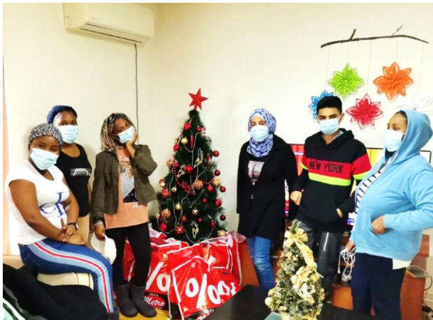
Children accommodated in Loznica Home for UASC were happy to receive New Year's presents, ©UNHCR, December 2020

On 17 December, a riot took place in Bogovađa Asylum Centre, which accommodates unaccompanied and separated children (UASC). Luckily, no one was seriously injured, however, as reported by Serbian Commissariat for Refugees and Migration (SCRM), the facility was substantially damaged. The police calmed the situation and 79 UASC were transferred to Preševo Reception/Transit Centre. UNHCR, Indigo and SCRM identified 13 most vulnerable minors and are following up on their needs. On 24 December, the Ombudsman launched an investigation to establish the circumstances of the incident; the following day, the police arrested five Afghan minors for suspected coercion, abuse and damage to reputation on the grounds of religious, ethnic and other affiliation, and for destruction of property. The minors remain in detention pending investigation.