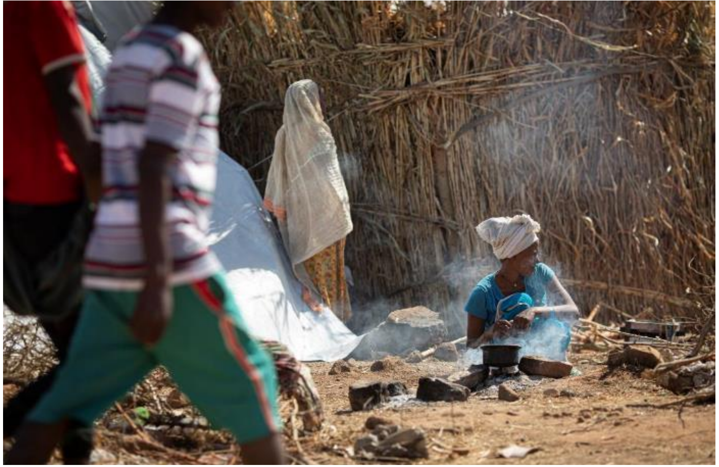
"I came here two weeks ago with my sister. We heard the heavy weapons firing in the city and then we fled."An Ethiopian refugee, makes tea for her family outside their temporary shelter at Um Raquba camp in Al Qadarif state, Sudan.

On 9 November, the first refugees from Ethiopia started to arrive at two border points, Lugdi and Hamdayet, in East Sudan. The refugee influx soon dramatically increased and spread along the extended border in remote locations in Kassala and Gedaref States. As of 15 December, 50,595 Ethiopian asylum-seekers had crossed into East Sudan from the Tigray region in Ethiopia. Refugees continue to arrive to the remote border areas of Hamdayet (35,517) in Kassala State, and Lugdi and Abderafi in Gedaref State (14,376). 702