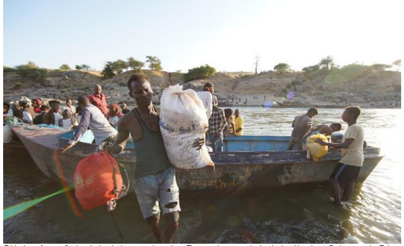
Ethiopian refugees, fleeing clashes in the country's northern Tigray region, cross the border into Hamdayet, Sudan, over the Tekeze river.

The conflict in the Tigray region in Ethiopia has led to immediate and large-scale forced displacement across the border into East Sudan. The refugee influx to East Sudan started on 9 November with 146 Ethiopians arriving through two border entry points. Since then the movement dramatically increased with thousands of refugees crossing into Kassala and Gedaref States. In an effort to prevent further escalation of the conflict, the African Union and several other third parties have offered mediation. There has been continued strong