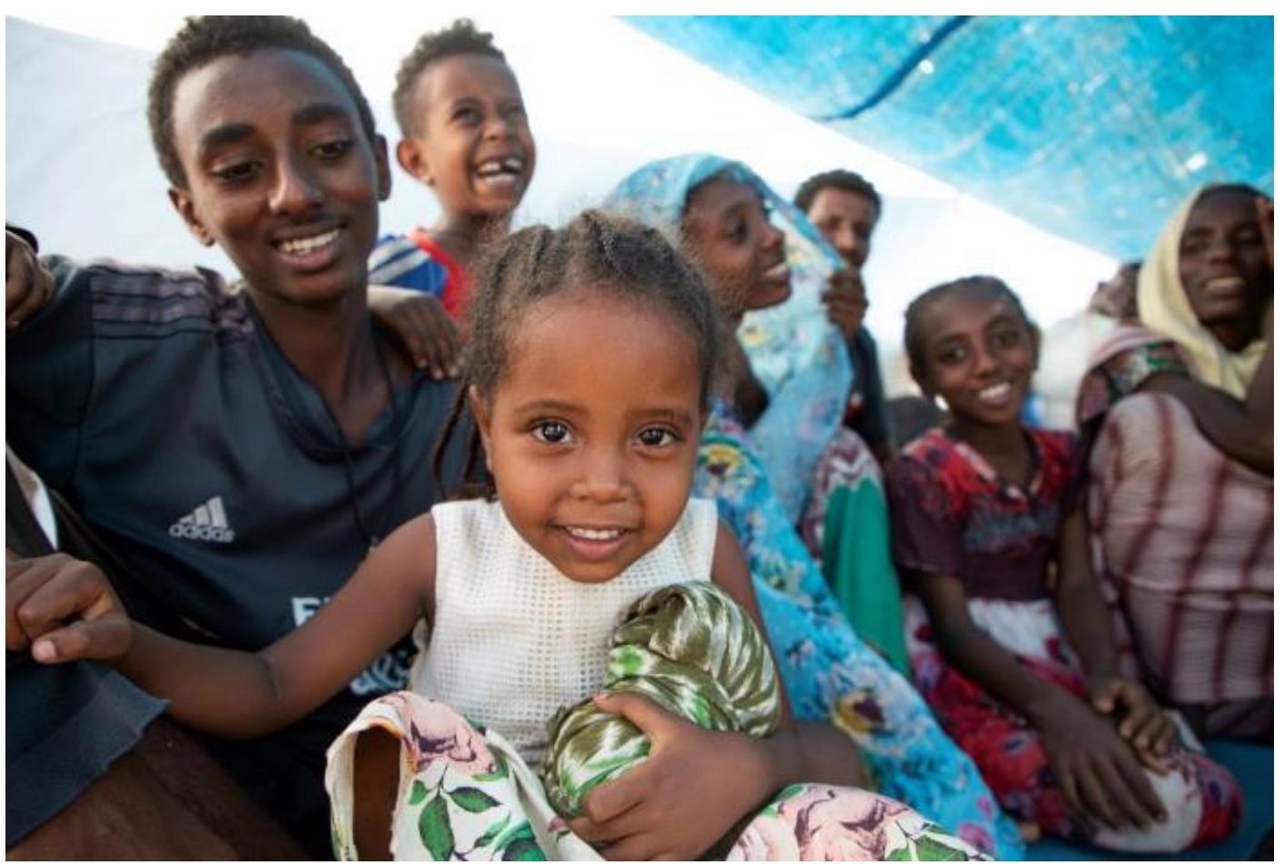
A four-year-old Ethiopian refugee sits with her family at Hamdayet border reception centre in Sudan, after fleeing their village.