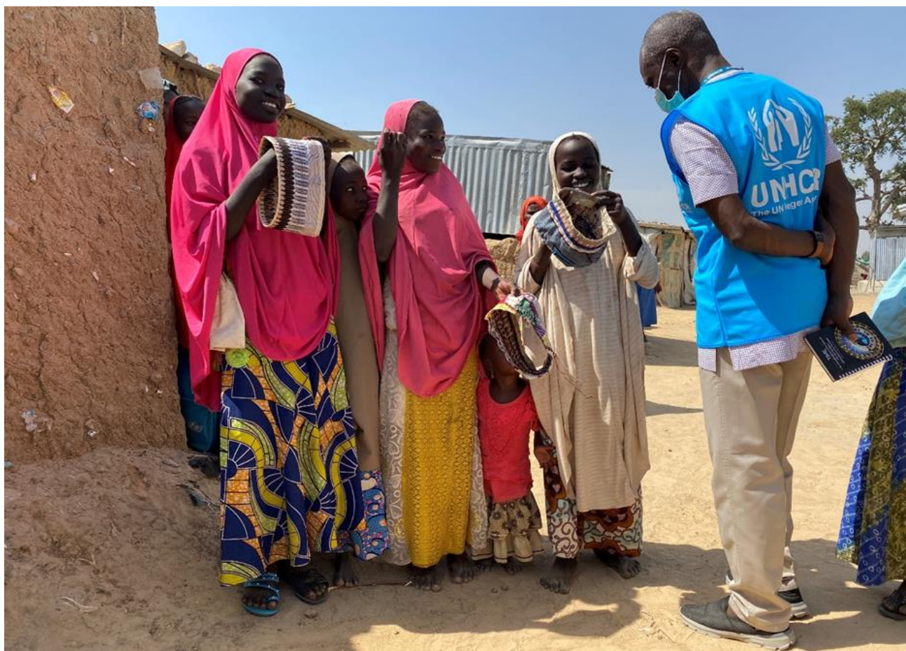
Young internally displaced girls present hats of their own handcrafting skills in Basaki camp of Maiduguri