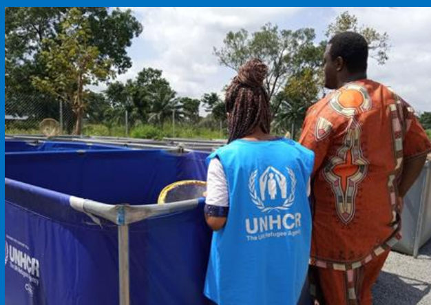
The collapsible fishponds installed in the Adagom settlement to conduct fish farming activities.