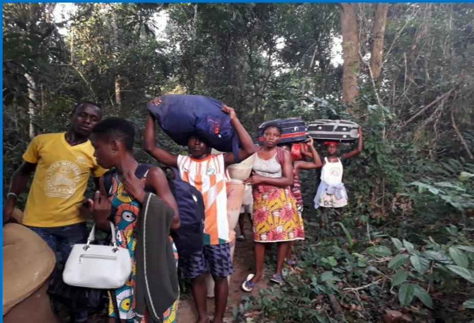
Ivorian refugees continue to arrive in Liberia, Ghana and Togo. Most of them are women and children from Côte d'Ivoire's west and southwest regions.

The vast majority of these new Ivorian refugees have fled to Liberia and over 60 per cent of them are children, some of whom arrived unaccompanied or separated from their parents. Older people and pregnant women have also fled, most carrying just a few belongings and little to no food or money. Most of them have settled among local communities where there are little preventives measures are in place to mitigate the risk of COVID-19 contamination.