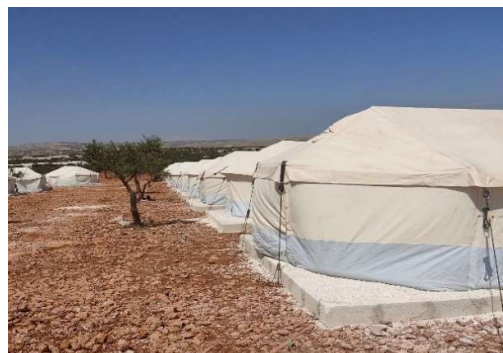
Gravelling of tents in Idleb.

In August, UNHCR's partners reached 76,662 conflict-affected and displaced people with distributions of 4,044 non-food item (NFI) kits (785 NFI kits in Idleb and 3,259 in Aleppo) and 9,407 tents (3,390 in Aleppo and 6,017 in Idleb). Moreover, by the end of August, UNHCR's partners did quick fixing to rehabilitate 2,000 houses for approximately 12,000 people. At the same time, UNHCR's protection partners conducted awareness raising and psychosocial support sessions, identified cases and referred them to basic services in Idleb and Aleppo Governorates; such community-based protection interventions reached 13,725 people . In addition, 3,762 displaced and vulnerable people received protection services such as awareness raising on civil status documentation and housing, land and properties, legal counselling and assistance, case management and referrals.