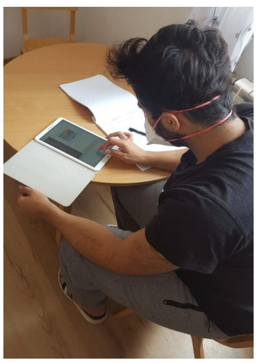
Asylum-seeker in Bosilegrad RTC using online platform to learn Serbian language, July 2020

Cultural Mediators of partner Crisis Response and Policy Centre (CRPC) supported the home-schooling of six refugee schoolchildren, Serbian language and culture and English classes for 26 UASC at Bogovađa AC and 12 arts & crafts workshops with 20 UASC in Bogovađa AC, Vodovodska Shelter and JRS Integration House. Sigma Plus' online platform for learning Serbian language continued to support 25 learners. Partners Indigo and Sigma Plus organised 107 group activities (recreational, educational and PSS) with children and parents in five RTCs in the south and the east of the country.