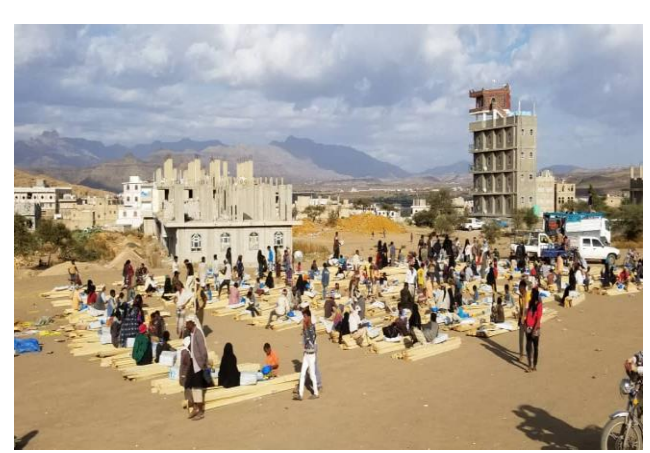
Basic household items and emergency shelter kits are distributed to families in Mawiyah district, Taizz governorate. Many parts of Taizz and the neighbouring AI Dhale'e are inaccessible due to the insecurity.