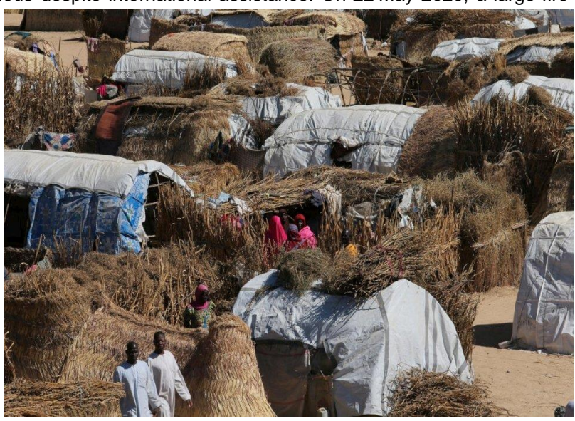
The Muna camp for internally displace people in Maiduguri, Nigeria, December 1, 2016.

which swept through one of the IDP sites around Maiduguri, the capital of Borno State, leaving two people dead and destroying the shelters and belongings of over 4,000 displaced people. The fire began after sparks from a cooking fireplace spread out and ignited a fire which soon engulfed shelters all around the camp. In the past few months, several fire incidents have occurred in congested IDP camps across North East Nigeria where shelters are too close for safety UNHCR is working with the authorities, aid agencies and local partners to make sure those affected receive shelter and other relief items as people are once again displaced inside and outside of the camp. Many, including young children, are living under the open skies, needing immediate help with shelter, food and clothing and other core relief items.