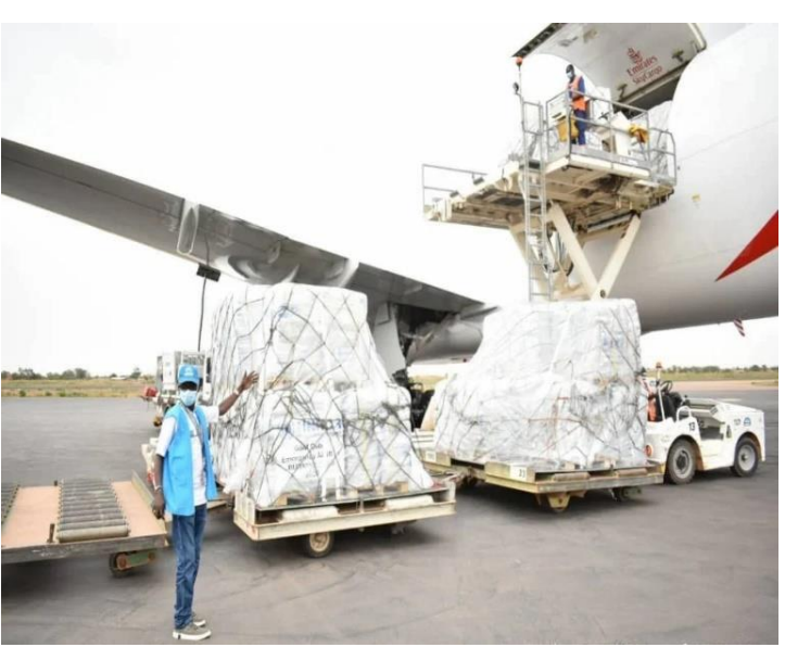
A UNHCR chartered plane landed at Ouagadougou Airport with 88 tonnes of emergency aid on board for refugees and internally displaced people in Burkina Faso.

seekers to access international protection and safeguarding the principle of non-refoulement. UNHCR Operations have also increased their direct support to national health systems to strengthen their infection prevention and healthcare responses, including through the provision of medical equipment and supplies and training of health personnel. UNHCR has also enhanced communication communities through the launch of an online platform in partnership with IOM to provide persons of concern and host communities with relevant. accessible. simplified, easy-tounderstand information on COVID-19 and prevention measures to be adopted. UNHCR operations also implemented targeted shelter interventions and distributing core relief items to help decongest the most overcrowded sites and allow for the implementation of the most basic prevention measures. They also increased their focus on strengthening community-based protection mechanism and enhancing the capacity and self-reliance of refugee and IDP communities including through the ramping up