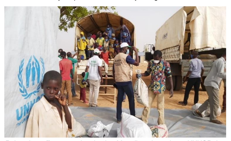
Relocation efforts ongoing in the Maradi region where UNHCR has already transported over 6,700 Nigerian refugees to safer villages and better living condition.

brings to over 70,000 the estimated number of Nigerian refugees who arrived in the area since April 2019. The Niger confirmed on 9 July that all of them would be granted prima facia refugee status. Most of them currently living in precarious conditions in villages scattered in a 20-kilometre deep band of land along the border. The priority for UNHCR is the relocation of the refugees to villages of opportunity away from the border, to ensure their effective protection and ease the pressure on host populations of the border area. As end of June, over 6,700 refugees have been relocated and the objective is to reach 15 000 by the end of The assistance provided by August. UNHCR and its partners also targets the host populations of these traditionally underserved areas basic infrastructures and public services are lacking.