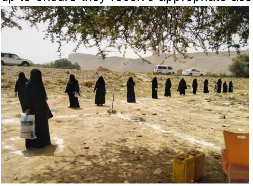
Displaced women are queuing up for while keeping social distance at a distribution of basic household items in Sahar district, Sa'ada Governorate, north of Yemen.

Somali community leaders referred 51 Somali refugees to UNHCR who had been forcibly relocated to the south from the border cities with KSA. UNHCR is following up to ensure they receive appropriate assistance, including registration support. Rapid