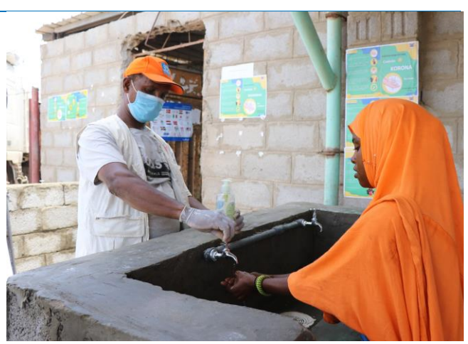
A UNHCR partner staff educates a refugee woman on hand washing at a distribution site in Kharaz Refugee Camp. In March, UNHCR distributed soap and detergent to all camp residents, including additional quantities for the increased needs linked to COVID-19 prevention measures.

Percent of registered refugees in Kharaz Camp are elderly (>60 years old)