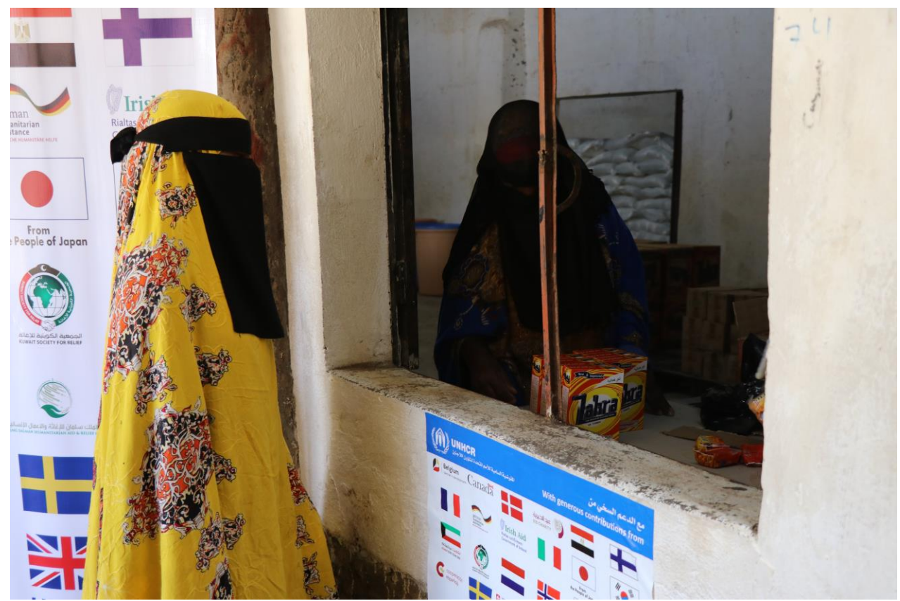
A refugee woman receives soaps, detergent and sanitary pads at a distribution site in Kharaz Refugee Camp. In March, UNHCR distributed soap and detergent to the camp residents. UNHCR provided additional quantities to cater for the increased needs link to COVID-19 prevention measures. © UNHCR/ YPN Media, March 2020.