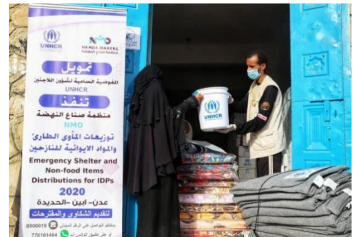
UNHCR partner staff hands over a bucket to a displaced woman during a non-food items distribution in Zanjibar, in Abyan governorate.

UNHCR and partners distributed core relief items to over 450 newly displaced families (nearly 2,700 persons) in Zanjibar and Khanfar, and close to 350 families newly displaced by conflict in Al Dhale'e. In this respect, UNHCR has nearly exhausted all its resources and will not be able to provide emergency assistance to families displaced by the conflict after June. UNHCR urgently needs funds to continue to provide emergency shelter and household kits to newly displaced families. If funds are not received, 281,000 highly vulnerable displaced people will be forced to live in open sites with exposure to harsh weather conditions and with no personal safety.