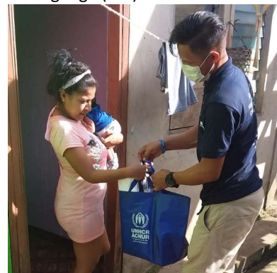
Figure 1: Hygiene and baby kits were distributed to single mothers in Port Kaituma, Region 1