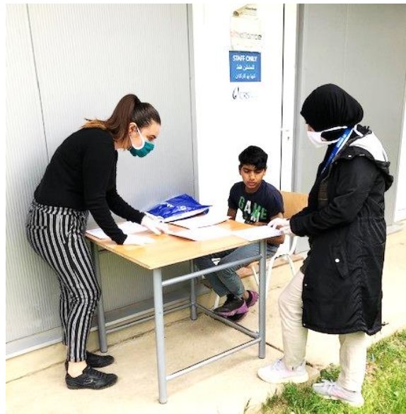
UNHCR partners making sure that schooling does not suffer during lock-down in asylum centres, ©Indigo, May 2020