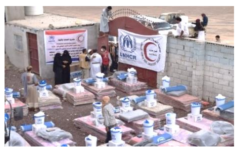
Basic household item distributions are prepared for families affected by floods in Marib governorate.

Clashes in Al Bayda governorate forced at least 600 families to flee to various districts in neighbouring Abyan in the south. Further displacements due to ongoing fighting are expected in the coming days. The UNHCR-led