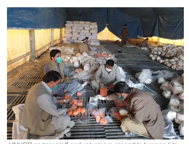
UNHCR partner staff and volunteers assemble hygiene kits before their distribution to needy Afghan refugee families in