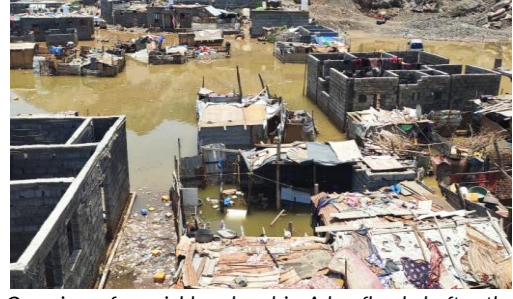
Overview of a neighbourhood in Aden flooded after the heavy rains and flash floods that hit the city on 21 April. © UNHCR/INTERSOS, April 2020

Following needs assessments, the second cash distribution began for IDPs, targeting 2,400 IDPs, returnees and most vulnerable host community families in the Government of Yemen governorates of Lahj, Hudaydah,