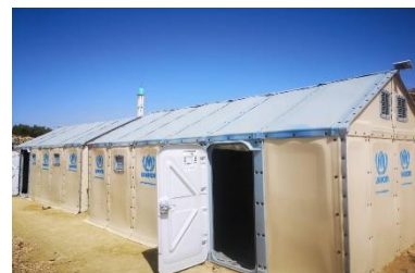
UNHCR installed two RHUs for use as temporary classrooms for girls attending grades 1-3, who otherwise would have missed school due to distance.

In Sana'a, a total of 974 refugees, asylum-seekers and vulnerable host community members visited two UNHCR-supported hospitals. Out of those, 119 were cases involving mental health. The occurrence of mental health problems continues to rise, caused by deteriorating resilience and aggravated by the constrained protection space. Some 60 persons were referred for secondary health care treatment.