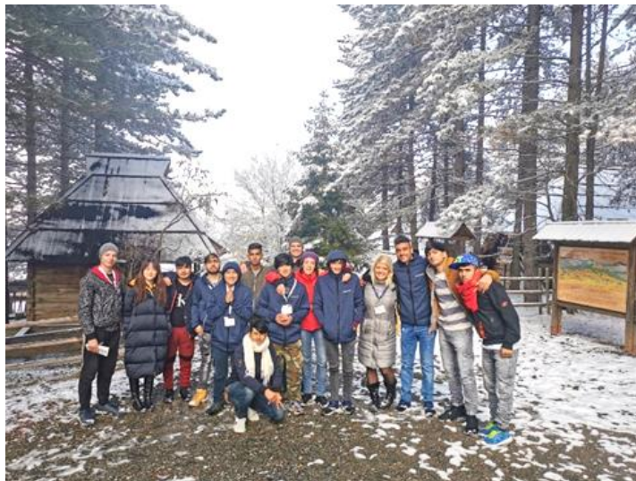
UASC peer educators in Sirogojno, Zlatibor, ©DRC, 4 December 2019