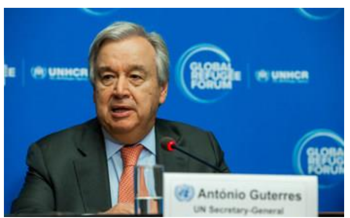
The UN Secretary General, Antonio Guterres, at the Global Refugee Forum in Geneva on 17 December 2019

On 16-18 December, the first-ever Global Refugee Forum brought together, in Geneva, refugees, heads of state and government, UN leaders, international development organizations, business leaders and civil society representatives, among others. The aim of the Forum was to generate new approaches and long-term commitments from a variety of actors to help refugees and the communities in which they live in line with the Global Compact on Refugees, adopted by the United Nations General Assembly in December 2018. In all, the Global Refugee Forum was attended by some 3,000 participants, including refugees, and 750 delegations and over 770 pledges have been made globally for financial, technical, and material assistance in areas ranging from employment, to places in schools for refugee children, new government policies to enable greater inclusion of refugees in society, solutions like resettlement, clean energy, infrastructure and better support for host communities and countries. The Sahel took center stage at