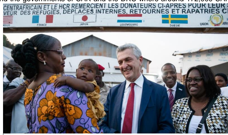
UNHCR's High Commissioner Filippo Grandi and Regional Bureau Director for West and Central Africa, Millicent Mutuli, greeting returning refugees in Bangui on 2 December 2019

refugees are living. During a visit to the Central African Republic from 2 to 5 December, the UN High Commissioner for Refugees, Filippo Grandi, met with President Faustin-Archange Touadéra to discuss the efforts still needed to create the conditions for informed, safe, dignified and sustainable returns. There are nearly 600,000 refugees from CAR in neighboring countries and a similar number displaced inside its borders. Continued protection in hosting countries or in places of displacement is be needed for those who do not feel safe to return home. Since 2017, UNHCR has facilitated the voluntary repatriation of over 13,500 CAR refugees to their country of origins from DRC as well as Cameroon and the Republic of Congo, countries that have signed tripartite agreements with CAR and UNHCR in 2019. This is in addition to an estimated 127,000 spontaneous returns and pendula movements back and forth between