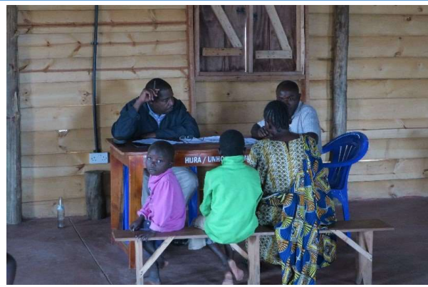
The Refugee Eligibility Committee (REC) session at Matanda Transit Centre