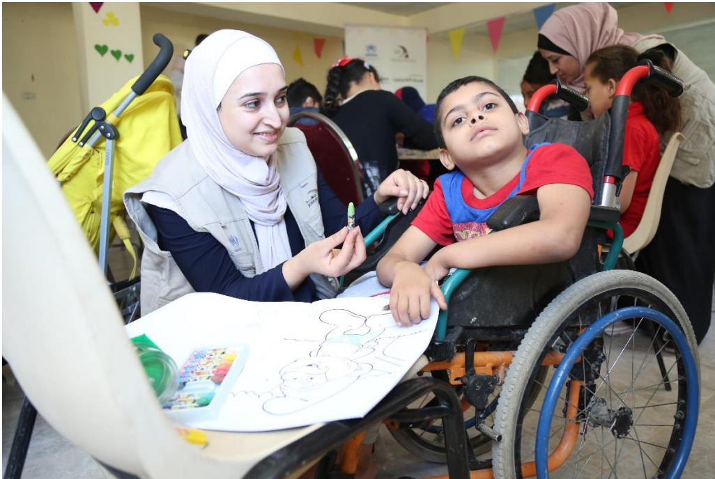
Awareness activity: an awareness session for Persons with Disabilities (PWD) and members of their families.

These networks help to provide a timely response in a critical time as well. For instance, the CSCs' networks are the most reliable and effective mechanism to identify the affected families in winter-time emergencies. Finally, the independence that is given to CSCs in the engagement process makes them more responsive and innovative, as they are able to plan and implement the activities more independently and equally, in consideration of the communities' needs.