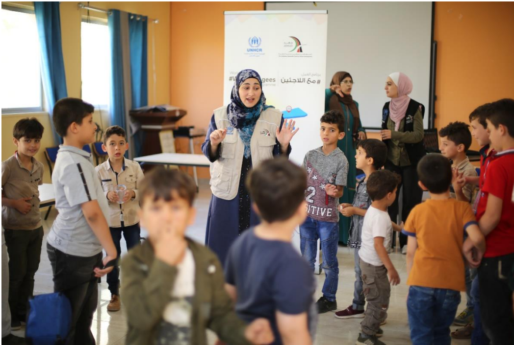
Cultural activity: "Hakawati" Storytelling, Tafilah CSC.