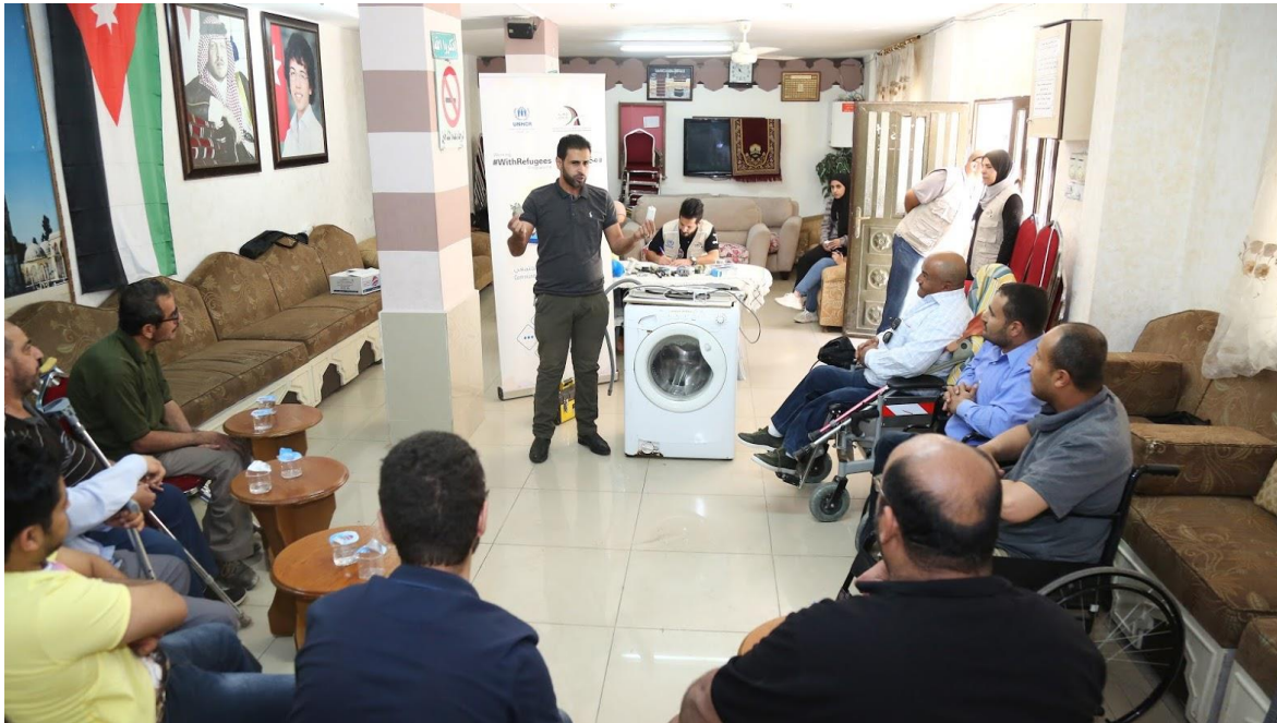
Training activity: Maintenance of washing machines, Sweileh CSC.