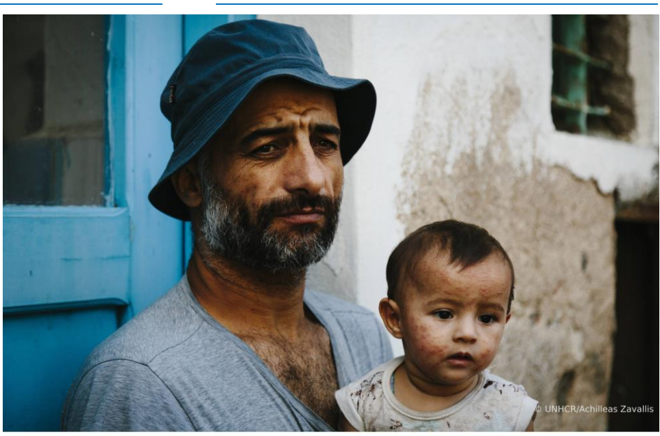
An asylum-seeker from Syria holds his young daughter outside an abandoned building near the Lepida reception centre on Leros.