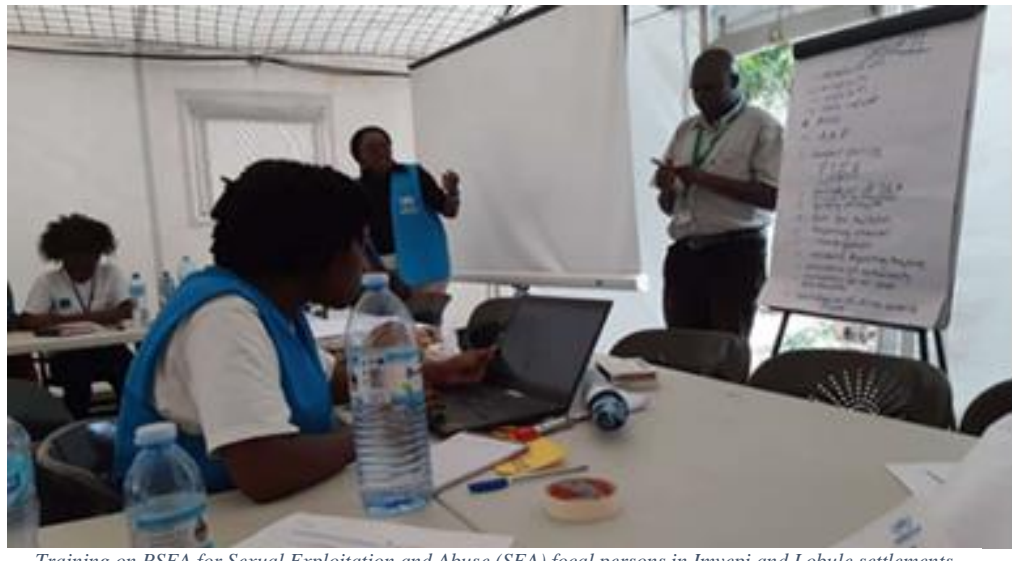
Training on PSEA for Sexual Exploitation and Abuse (SEA) focal persons in Invepi and Lobule settlements