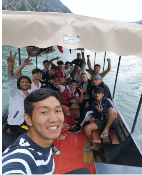
UNHCR supported the participation of 10 unaccompanied and separated children in Tara National Park camping trip, ©UNHCR, August 2019