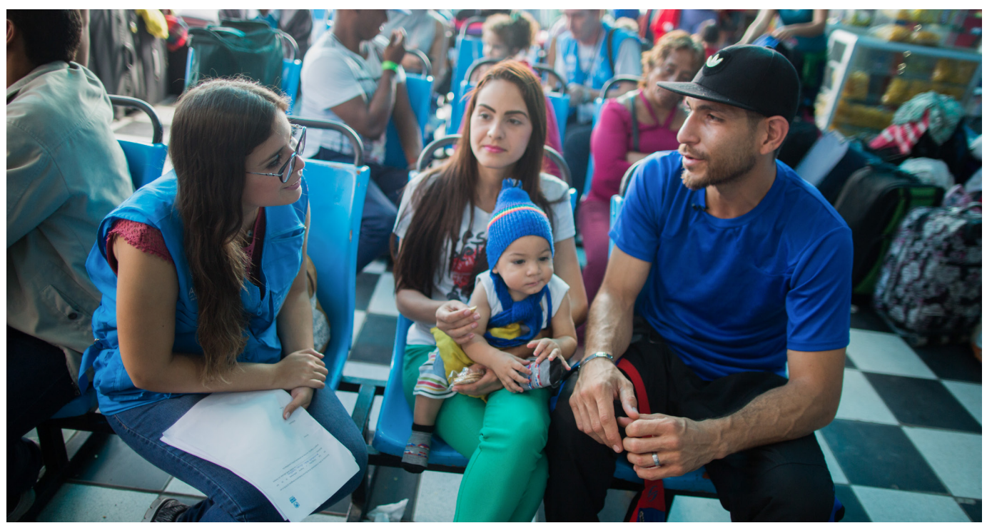
Colombia. A mother talks with a UNHCR protection officer after crossing the border.

The purpose of this document is to provide an overview of key developments affecting the displacement situation in the Americas and some of UNHCR response activities in line with the 2019 strategic objectives for the region.