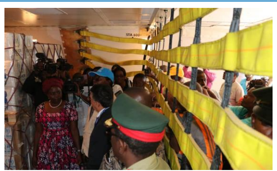
The CRIs delivered via the airlift