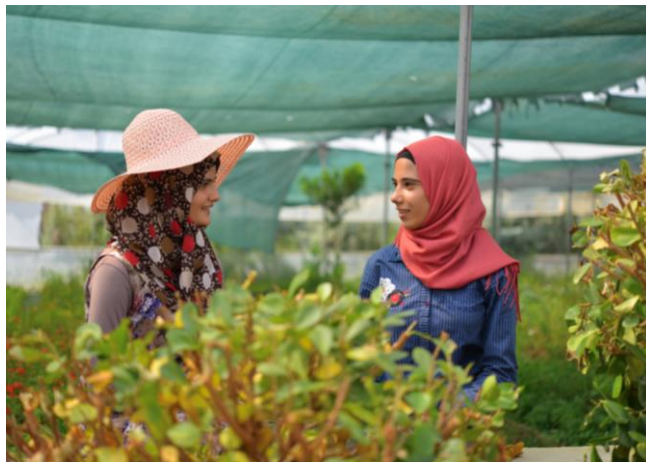
Syrian women receiving agricultural vocational training.

The Food and Agriculture Organization (FAO) organized a job fair in Izmir on 6 December to mark the completion of FAO-UNHCR's joint three-month agricultural vocational training programme, which aimed to expand livelihoods opportunities in the agriculture sector for refugees and host community members. The job fair provided an opportunity for 130 trainees to meet with close to 20 potential private employers operating in the food, agriculture and livestock sectors, exchange contacts and discuss possible job placements. FAO and UNHCR will continue to work together in 2019 on similar agricultural vocational training programmes in different provinces.