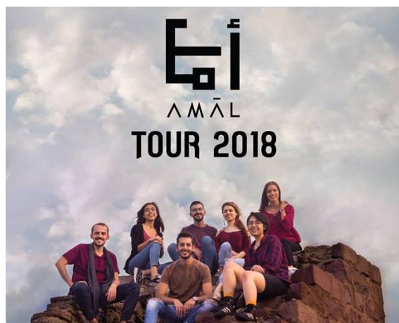
Amal Band gave five concerts in different cities of Turkey.