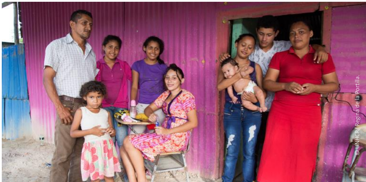
A Venezuelan family lives in an informal settlement in Arauca while they wait for information on their refugee status.

The Interagency Group for Mixed Migration Flows (GIFMM in its Spanish acronym) was created at the end of 2016 to respond to the increasing flow of people arriving from Venezuela. The group coordinates the national response to the situation of refugees and migrants, Colombian returnees and host communities in Colombia, complementing the response of the Colombian government. It is co-led by the International Organisation for Migration (IOM) and the United Nations High Commissioner for Refugees (UNHCR). It currently has 47 members, including 29 international NGOs, 14 UN agencies and four members of the Red Cross Movement.