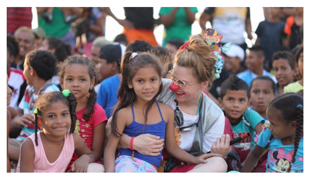
Clowns without Borders bring smiles and happiness to children in Riohacha, Guajira.

<sup>2</sup> Statistics Migration Colombia 2018 - 2019. Calculation comparing the figures of departures of Venezuelans by Rumichaca and San Miguel during the period of January and February in 2018 and 2019. Retrieved from: