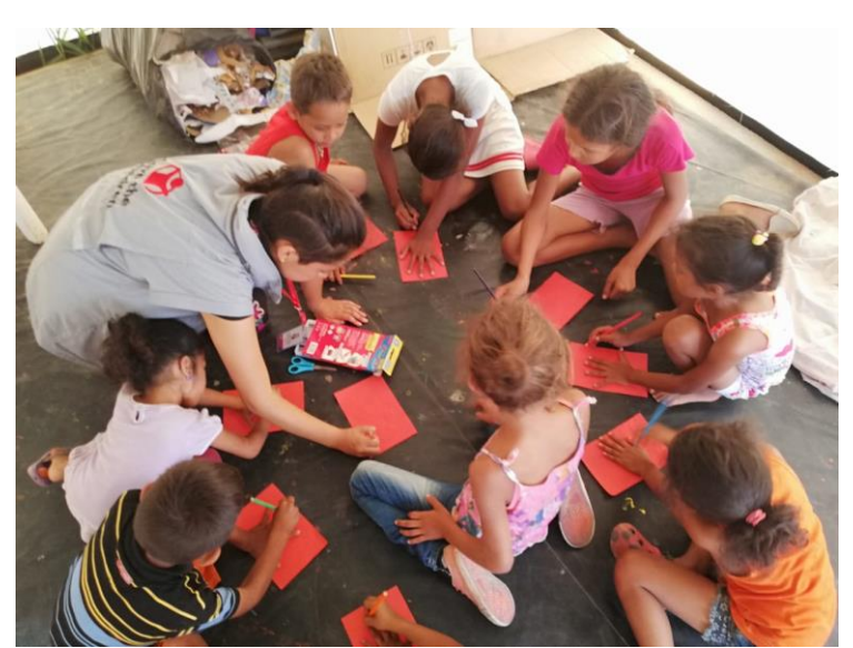
Recreational activities and psychosocial support for migrant children in Child Friendly Spaces, Arauca.

In La Guajira more than 4,700 children received psychosocial attention, including a number of children who have arrived in Colombia with aggressive behaviour and demotivation due to the breakdown of family ties.