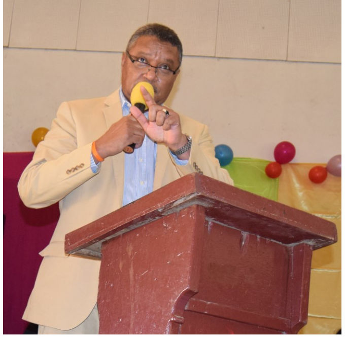
UN Resident Coordinator, Yacoub El Hillo delivering special messages from the Secretary-General.

Human Rights Day is observed every year on 10 December, the day the United Nations General Assembly (UNGA) adopted, in 1948, the Universal Declaration of Human Rights (UDHR).