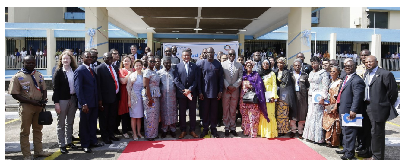
Group photo after the official 73rd UN Day Celebration.

The flag raising ceremony was the official programme marking two days of events under the theme "From peacekeeping to sustainable development in Liberia". The events included sporting activities involving all UN Agencies, Funds and Programmes and a radio talk show with heads of agencies.