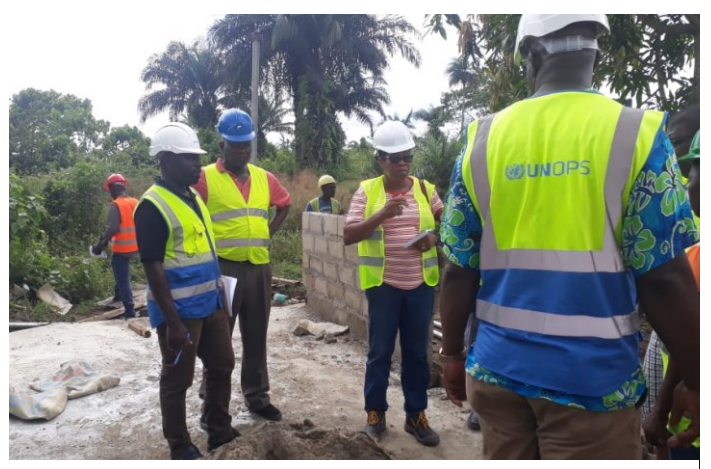
UNOPS and stakeholders jointly conducting routine project site inspections.

Engagement and partnership : With University of Liberia, Environmental Protection Agency, Liberia Fire Service, One UN House Facility Management Unit.