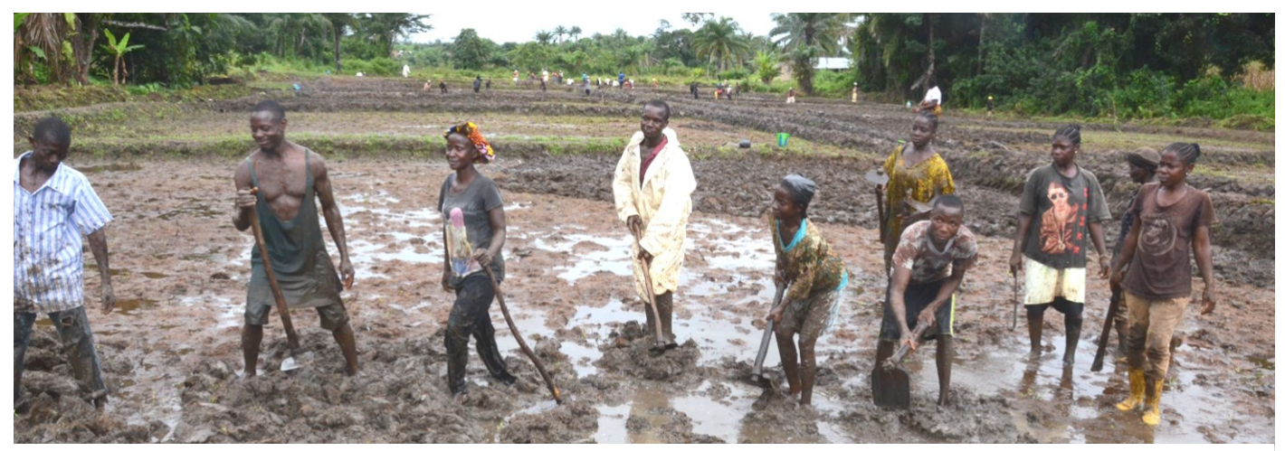
Rural farmers working on their site under the food for assets creation SHAD-P initiative.

According to the CFSNS Report, Liberian households (Bong County included) headed by individuals with little or no education are more vulnerable to food insecurity. The report demonstrates that approximately 28% of household heads have no form of education. Out of these households, 24% were notably food insecure; 21% were moderately food insecure; and 3% were severely food insecure.