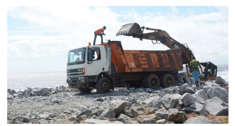
Truck offloads rocks at the project site in New Kru Town.

The Ministry of Mines and Energy, in collaboration with the Environmental Protection Agency (EPA), is responsible for the procurement of equipment, rocks, geo-fabric mats, and the services of temporary staff, while as a key implementation partner, UNDP is in charge of hiring the core project staff, including an international coastal engineer; who has completed baseline surveys and recommended appropriate project designs.