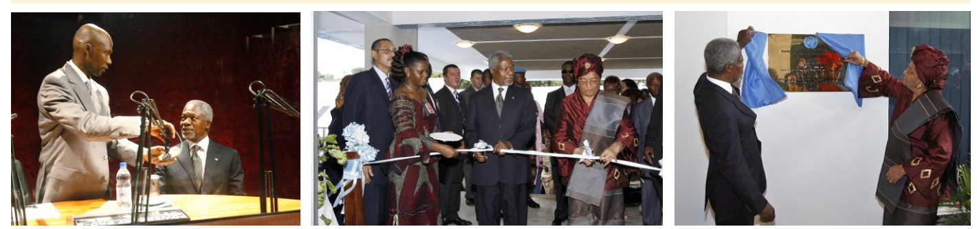
(L): Former SG interviewed by UNMIL Radio. (M and R): Former SG and Former President of Liberia attend the Inauguration of UNMIL Headquarters.

"Liberians have lost peace once and now they must appreciate it and yearn for it. They have to work together and turn diversity into strength. They have only one Liberia and it is in their interest to work together to make this country what it ought to be. They should not go after group interest or individual interest. They need to chip in and do whatever little things that they can do and not just sit back and wait for the Government to do everything for them."