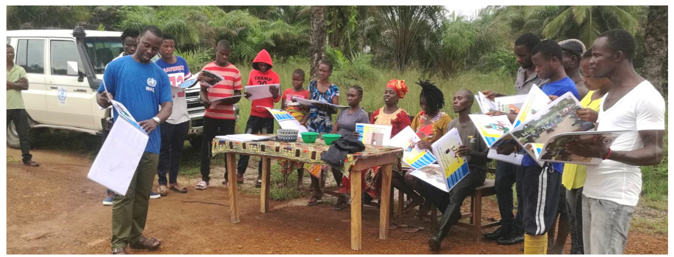
WHO National Epidemiologist sensitizing community Health Volunteers on Integrated Disease Surveillance and priority disease response, Gbarpolu County, Liberia

The World Health Organization (WHO) in Liberia, in collaboration with the Ministry of Health and National Public Health Institute of Liberia, has supported the training of 450 community health volunteers from three counties: Bomi, Grand Cape Mount and Gbarpolu.