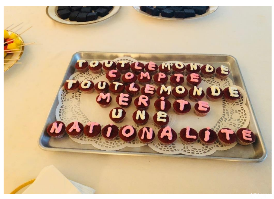
"Friends of Statelessness" event USA Residence - September 18th 2018