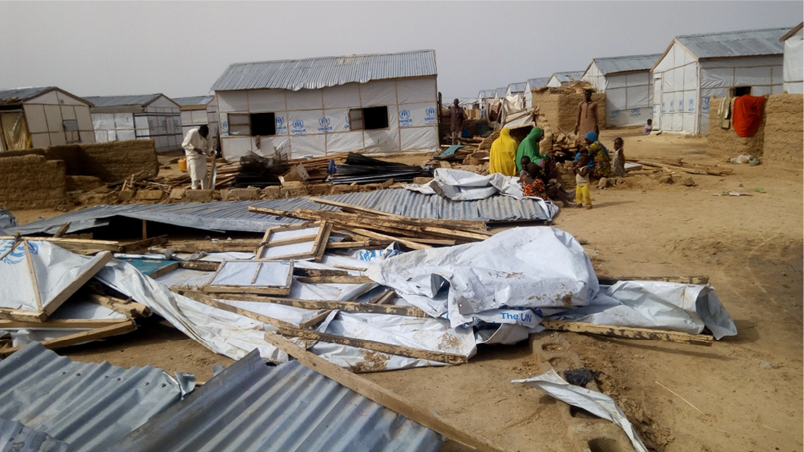
SHELTERS AFFECTED AS A RESULT THE RAINS AND WINDSTORM IN BAKASSI CAMP, MAY 2018