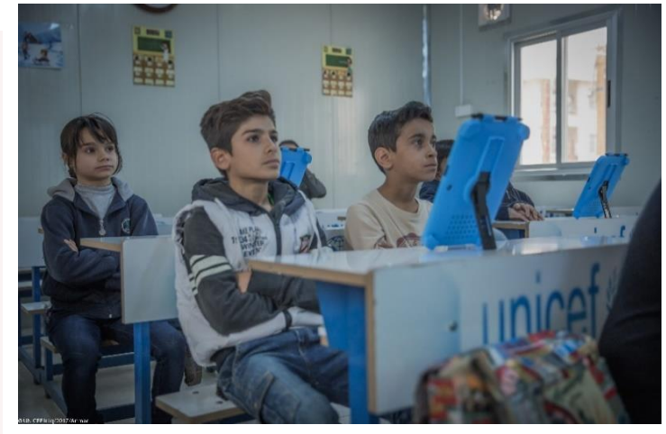
Students attending E-Learning Program